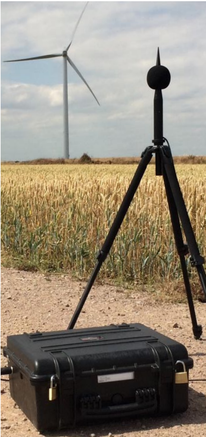
The robust Outdoor Noise Monitoring Solution consists of the XL2 Sound Level Meter, a NetBox with mobile data connection, the heavy duty outdoor case (IP65), extended battery power supply and the outdoor measurement microphone M2230-WP.